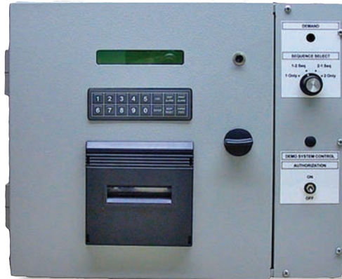
Central Control Node